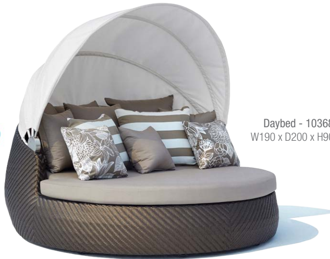
Daybed - 10368 W190 x D200 x H90cm